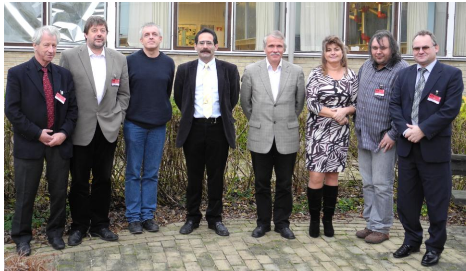
The first project meeting of European project "Virtual Nanotitanium" in Risø Campus, Roskilde: representatives of DTU, Goethe University Frankfurt, Materials Institute Spain, Technion and a company Timplant.

The implants should remain functional over dozens of years without any deformation, and also without producing any toxic substances in the body. Titanium is a rather strong material, with high biocompatibility, and is therefore one of the most promising materials for medical implants in trauma surgery, orthopedic and oral medicine.