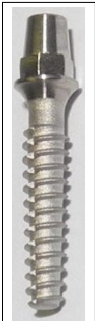
Prototype of nanotitanium based small radius dental implant (Timplant)